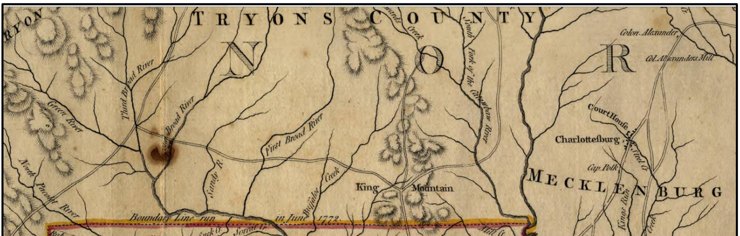
SANDY RUN CREEK AND THE THREE BROAD RIVERS ARE VISIBLE IN THE LOWER LEFT PART OF THIS 1775 MAP OF NORTH CAROLINA, https://dc.lib.unc.edu/cdm/singleitem/collection/ncmaps/id/125/rec/55

According to the booklet, Sandy Run Settlement & Mooresboro , "The Sandy Run settlement may have begun as early as the 1750s." Settlers were attracted to the area because Sandy Run Creek provided swift-flowing water, which was needed for farming and was ideal for operating a grist mill. The settlers established The Anabaptist Church or Society of Sandy