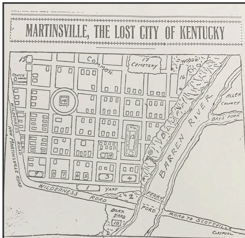
Circa > 1815

“McFaddin's and Claypool's Stations, while of considerable importance, were left far behind in the race as commercial centers, with their sister settlement at Martinsville. In 1800, Martinsville was the metropolis of Warren County, and with a steadily increasing population, promised to be the place of first importance in Southwestern Kentucky.” 9