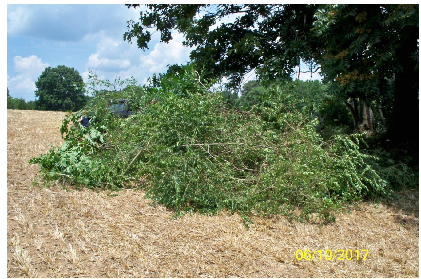
As you can see a great deal of stuff was removed from this cemetery